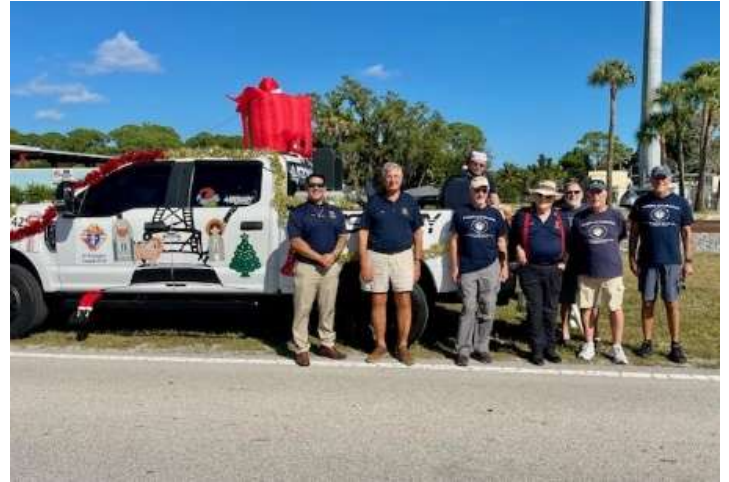
Brother Knights line up to represent our Council in the Hobe Sound Christmas parade.