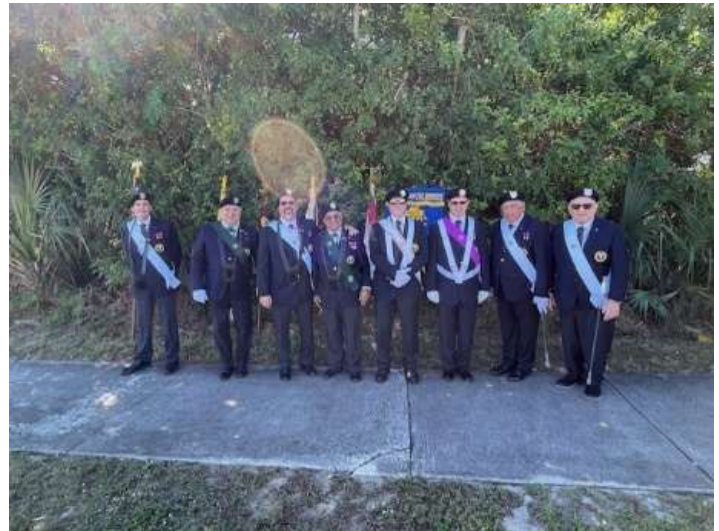
Members of the 4 th Degree prepare to march with our Council in the Hobe Sound Christmas parade